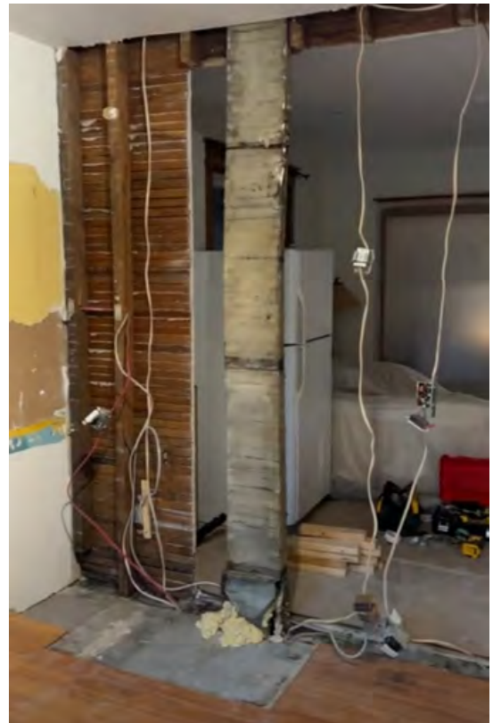
Demolition during kitchen remodeling.