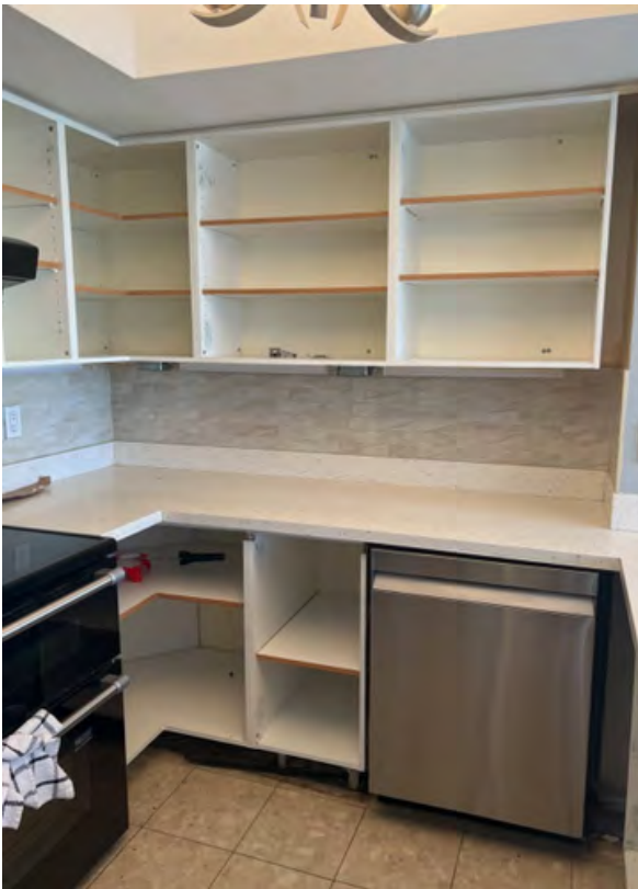
Demolition during cabinet refacing project.

This stage typically takes 1-3 days, depending on the extent of the renovation. After demolition, your kitchen is ready for the next steps in its transformation.